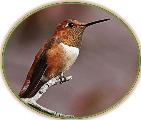
Rufous Hummingbird ( Selasphorus rufus ) Radford, Virginia ~ October 2013 Article on Page 3

PHOTOGRAPHY BY STAN BENTLEY PULASKI, VIRGINIA