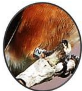
Close-up of band

Virginia twice is astounding. But even more impressive is that this bird found its way to the same house and same feeder station as last year. Some folks argue that banding is too stressful on birds. But banding is basic to bird migration studies. And if the banding from last fall was particularly stressful to this wanderer, either the experience wasn't all that stressful or the bird has a short memory. If either were the case, I expect the bird wouldn't have found its way back to the same spot after a year of peregrinations across the continent. We believe it has now departed after about two and a half weeks.